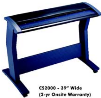
CS2000 - 39" Wide (2-yr Onsite Warranty)

High-performance, full-color 39" wide scanning is yours with the CS2000 color scanner. Features like 24-bit color, 800dpi (600dpi optical) resolution, 3.8"/sec. scanning speed and fully integrated software will meet or exceed your scanning needs.