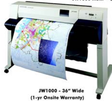
JW1000 - 36" Wide (1-yr Onsite Warranty)

A 1" wide head with 1,280 nozzles for each of the 6 colors combines high speed with sharp detail and output speeds of 70 seconds for an A1 size print. Whether your field is GIS, surveying, architecture, or machinery, the JW1000 will output all your drawings with sharp, crisp definition.