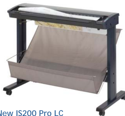
New IS200 Pro LC “Limited Color” Scanner

The CS400 was replaced by the CS500 Base & Pro models, which provide similar performance at similar pricing, but in a 42" width, instead of 40". The MSRP of the CS400 was $16,995, and the MSRP of the CS500 Base & Pro are $15,995 and $17,995, respectively.