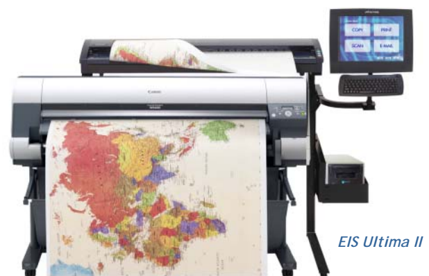
EIS Ultima II

The EIS Ultima II is a single-footprint large format color multi-function, scan, copy and print system designed for a broad range of applications including Facility Management, CAD, GIS and Reprographics. The new EIS Ultima II series includes a choice of four different Graphtec 42" color scanner models, a high-performance Rocket™ scan/print controller, touch-panel LCD monitor and a new 44" wide print engine.