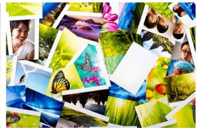
Graphic Art & Photographs

All SmartLF scanners are available in three affordable specification levels; monochrome, color and express color, (m, c, e). m and c models can be easily upgraded via unique Email process if requirements change.