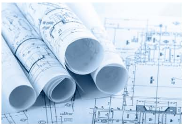
CAD and Technical Drawings

These uniquely versatile scanners capture the sharply defined line detail in technical documents and maps required for AEC, CAD and GIS combined with the highly accurate color reproduction and copying required for graphics and photographic documents – at a price you can afford.