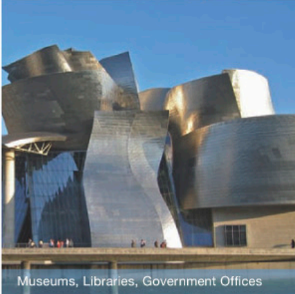
Museums, Libraries, Government Offices