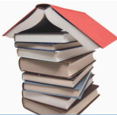
Odd Size Items - Books - Fragile Materials