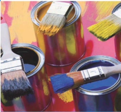
Copyshops - Reprographics - Original Artwork